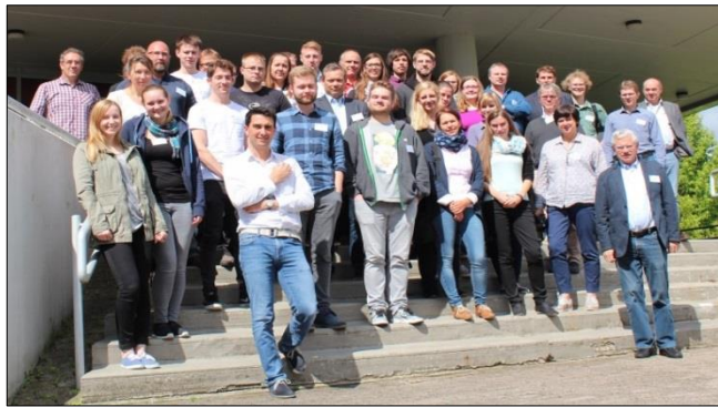
Participants in the de.NBI mini symposium "Bioinformatics for Metagenome Analysis" in Bielefeld

The symposium at Bielefeld University was attended by about 90 participants from Germany and Europe. The conference dinner took place at a typical Westphalian restaurant providing a pleasant environment for further scientific discussions.