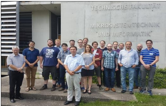
RBC service center Kick-off meeting in July 2016